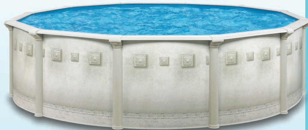
Round Millenium - Tuscan wall offered in 52 inches