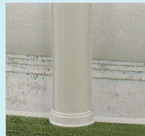
One-piece resin foot collar