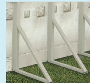
Heavy-duty angle brace system