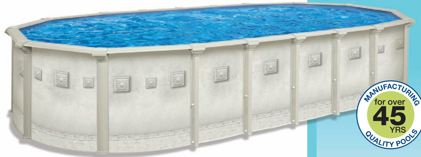
NBS oval Millenium - Tuscan wall offered in 52 inches

If you're handy with a screwdriver, then you can easily assemble your MILLENIUM Aquarian pool. We've designed each pool to make installation problem-free—no multi-sized washers or nuts to worry about. Just one large screw type is used to assemble the entire pool and we provide easy-to-follow instructions.