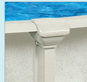
Ledge, cap and post designed for a secure fit