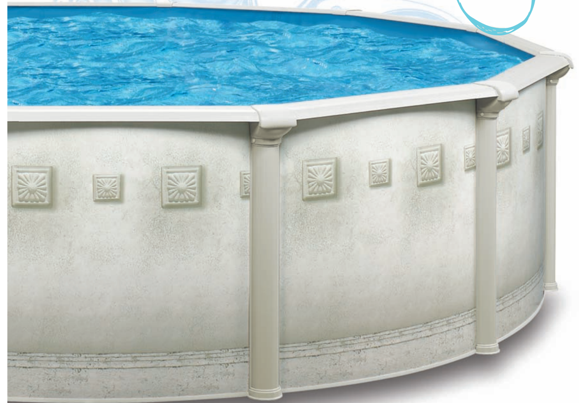
Round Millenium - Tuscan wall offered in 52 inches